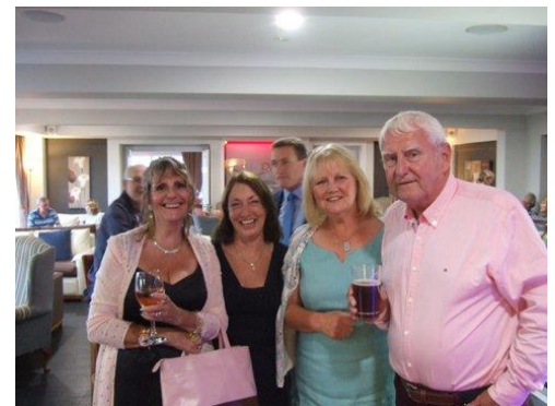
Roger with the ladies again!